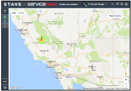
Use Heatmaps to Understand Proximity

When you see your data centers and associated problem records visually, you can know exactly where to divert your resources for maximum effectiveness.